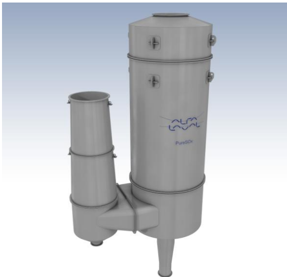
PureSOx by Alfa Laval (Alfa_Laval_PureSOx_background.jpg)

PureSOx is a trademark owned by Alfa Laval Corporate AB. Alfa Laval is a trademark registered and owned by Alfa Laval Corporate AB. Alfa Laval reserves the right to change specifications without prior notification.