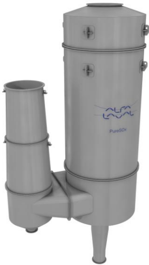
PureSOx by Alfa Laval (Alfa_Laval_PureSOx.jpg)